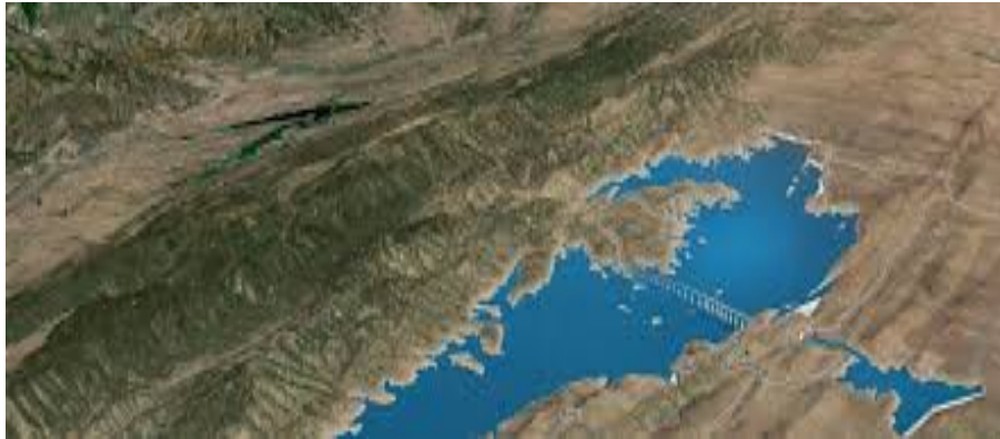
The Sites Reservoir- How it will look.

Sites Reservoir Project Offstream Water Storage North of the Sacramento-San Joaquin Delta