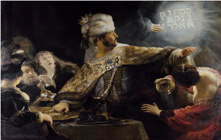
Belshazzar's feast by Rembrandt

https://www.larouchepac.com/a_month_of_satanic_oligarchical_conspiracies