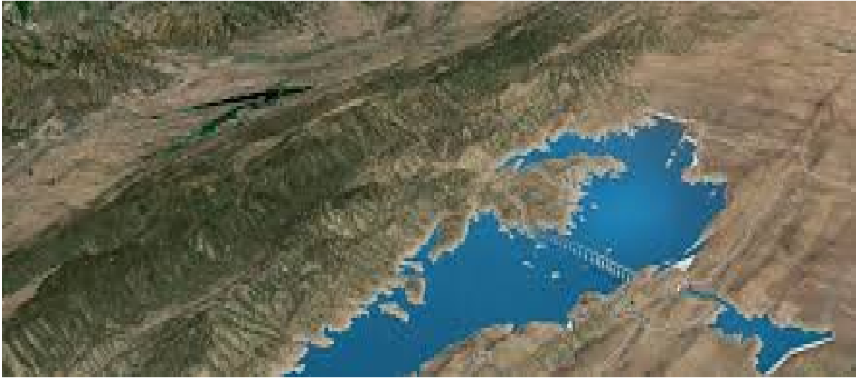
The Sites Reservoir- How it will look.

https://glenncounty.granicus.com/MetaViewer.php?view_id=9&clip_id=1701&meta_id=163332