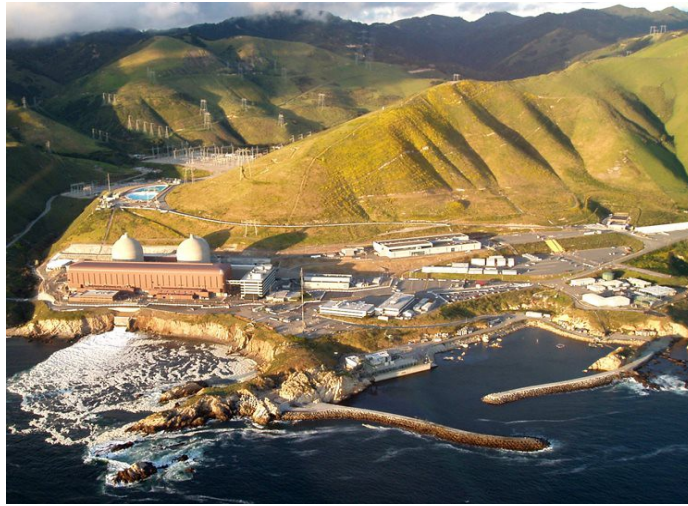
Diablo Canyon Nuclear Power Plant.

years is another example. But greatest opportunity to meet California's energy challenges while also achieving the goal of net zero is with nuclear power.